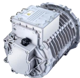
Permanent Magnet Synchronous Motor Max. Power: 60kw Max. Torque: 200N.m